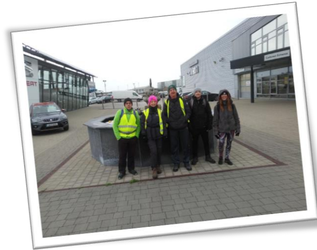
EVERY ONE ENJOYING LUNCH FOLLOWING SOCIAL