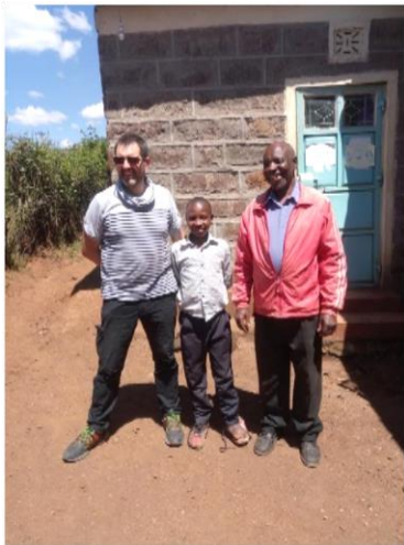
Just a few Photos of One of Le Cheile Disability Social days